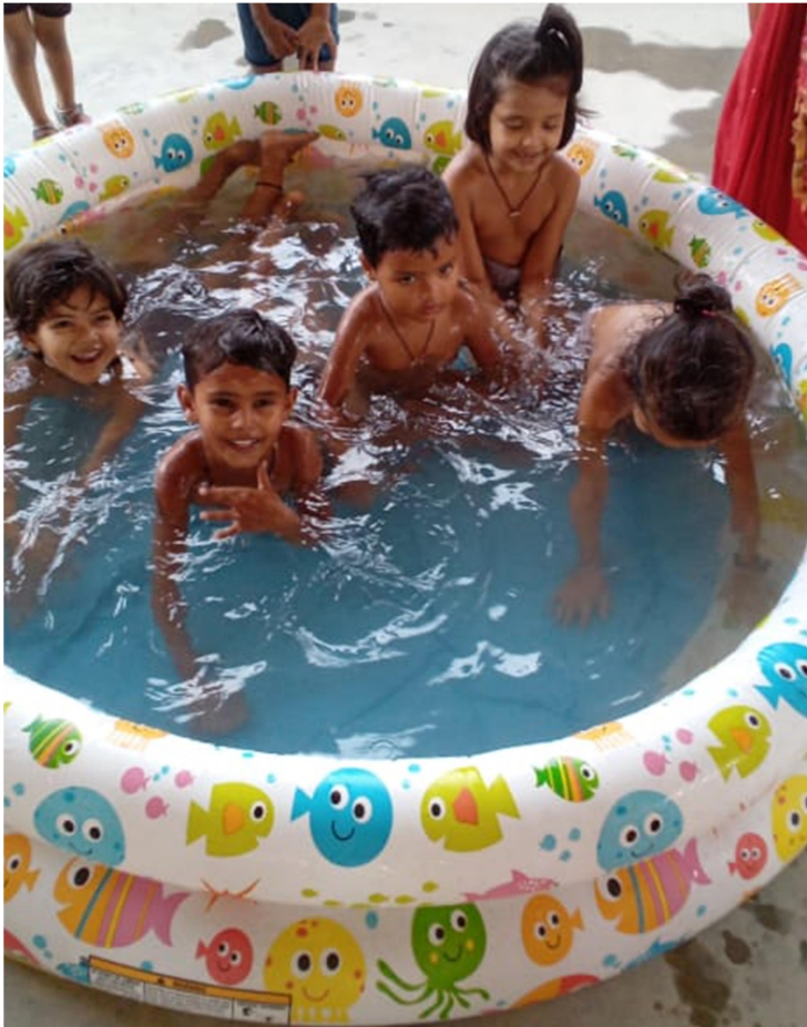
Chilling out - Beat the heath – Fun activity for kindergarten