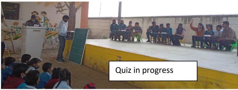
Quiz in progress