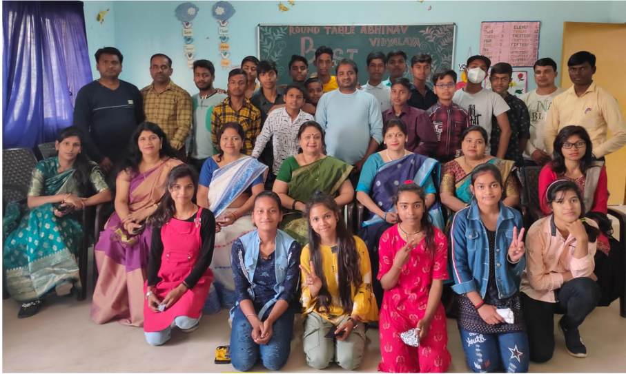
First batch farewell – Best wishes