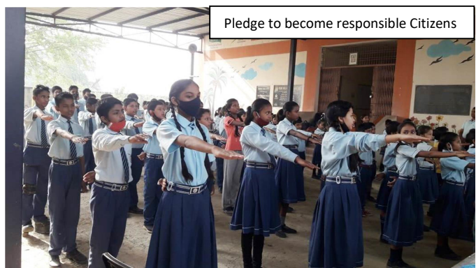
Pledge to become responsible Citizens