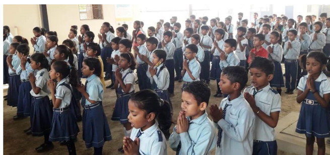
Morning prayer for wellbeing of all