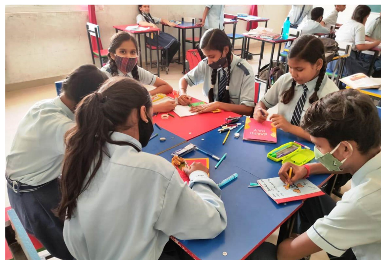
Enthusing creativity – greeting card making activity